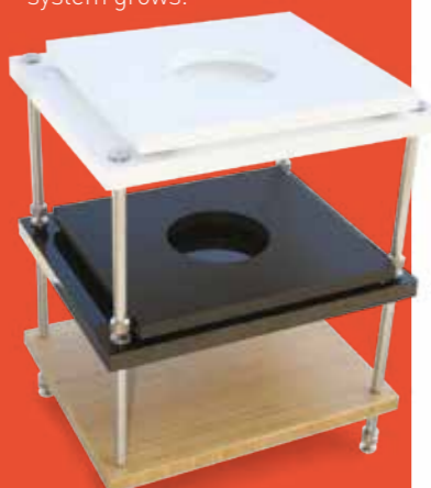
The PRS comes in white, black or natural bamboo

Individual Sanctum platforms are available to place under each component in your system, resulting in significantly enhanced sound quality as noted by Hi-Fi