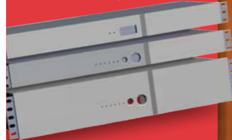
IsoTek's Smart Power range, set to launch in early 2017

Every component can be programmed and controlled from remote locations, with connectivity via RS 232, LAN, Bluetooth and Wi-Fi. All sockets can be switched independently using Android and iOS devices, or via a web browser,