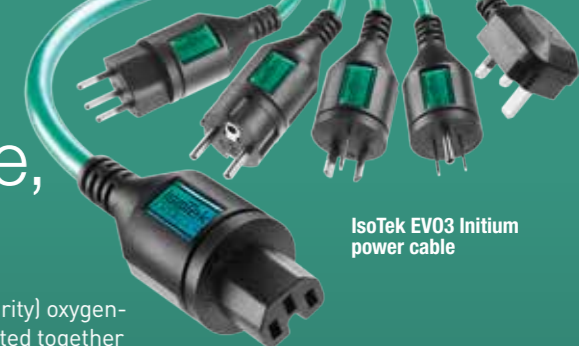
IsoTek EV03 Initium power cable

IsoTek has unveiled its most affordable power cable yet. Set to launch in May, the EV03 Initium will cost even less than the company's current entry-level cable, the EV03 Premier, yet it utilises many of the same performance-enhancing technologies and materials.