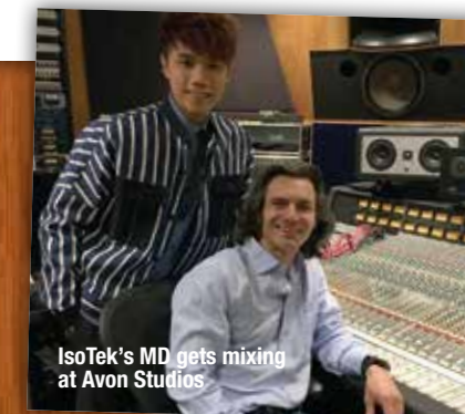
IsoTek's MD gets mixing at Avon Studios

Congratulations to all the worthy winners – their passion and dedication ensures that many thousands of music and movie fans around the world enjoy the benefits of IsoTek's innovative clean-power products every day.